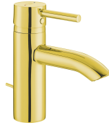
*RAK12000-09.GD1 Gold Color Glossy Finish