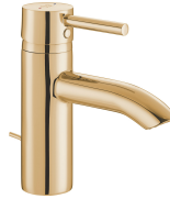
*RAK12000-09.RG1 Rose Gold Color Glossy Finish