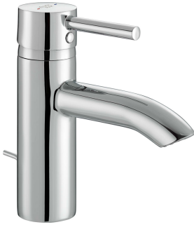
*RAK12000-09 Chrome Finish