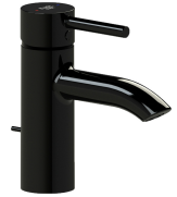
*RAK12000-09.BK1 Black Color Glossy Finish