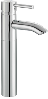
*RAK12001-09 Chrome Finish

Product: PRIME single lever high-raised basin mixer