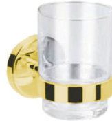
*RAK21007.GD1 Gold Color Glossy Finish