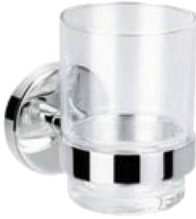
*RAK21007 Chrome Finish