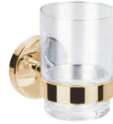
*RAK21007.RG1 Rose Gold Color Glossy Finish